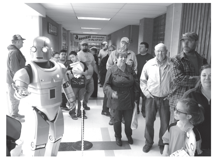
"Power" greets attendees at last year's MCREA Annual Meeting and Member Appreciation.

While the times have changed, our mission and outlook have not. Working together, we can accomplish great things for our members and the communities in our service area — now and in the future.